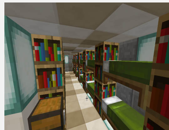
(Guard quarters, second floor)

Today we look at this awesome jail built by Colonel_Steiner and the_dude_777.