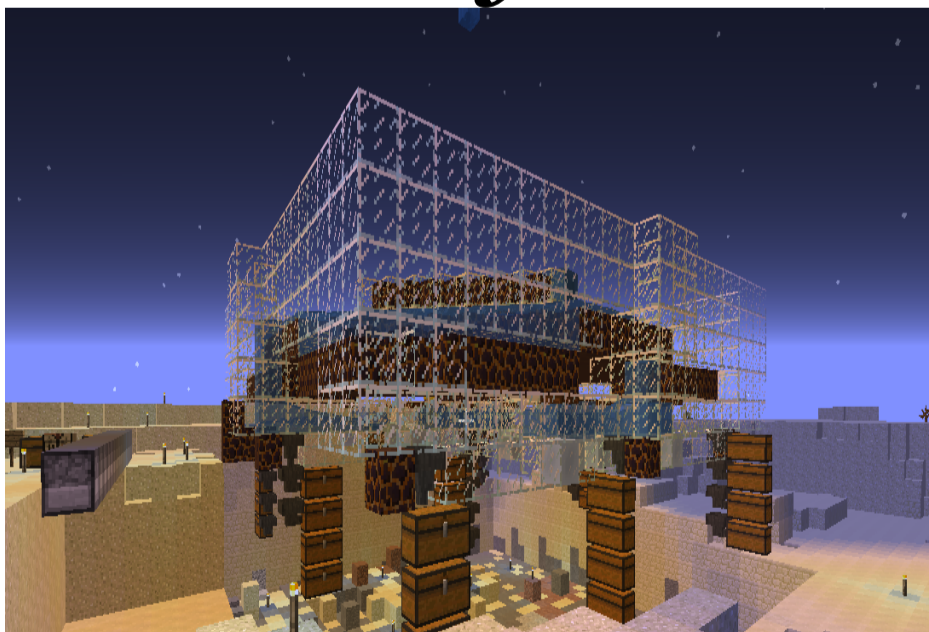
An image of the main farm with the storage system below it.

Don't forget our interviews as today, after a long delay, we finally have The_Emarld106's mob farm.